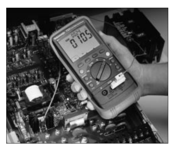
TIP: For temperature data-logging, use a TX3-DMM with its PC Interface Cable and WaveStar<sup>TM</sup> for Meters software (WSTRM).